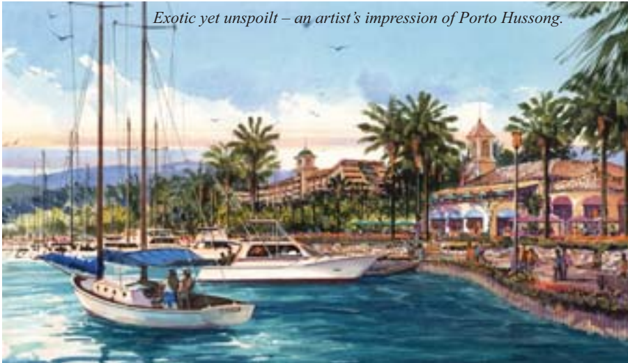
Exotic yet unspoilt – an artist's impression of Porto Hussong.