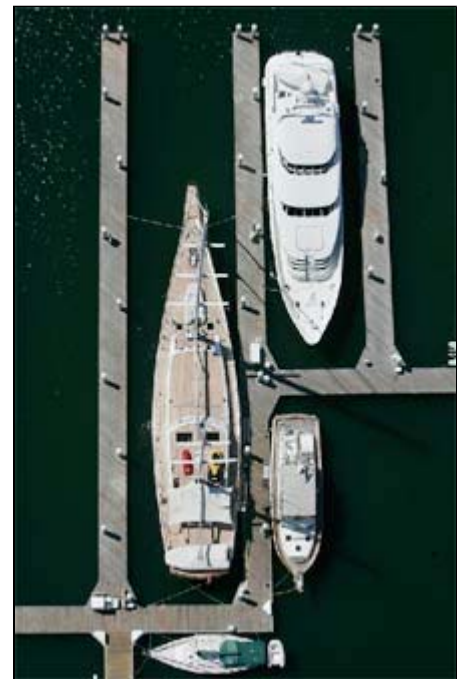
San Diego's Port District hopes to capitalize on the rising tide of 100- to 400-foot megayachts. Some local marinas do have some dock space that can accommodate the vessels, such as this 200-foot slip at the Shelter Island Marina occupied by the 126-foot ketch "Jagare" (left).

San Diego's Embarcadero is considered an ideal locale for yachts because of its proximity to the airport, boat services, high-end hotels, restaurants and the city's cultural offerings. It's also the first U.S. port on the Pacific for yachts sailing from South America and the last stop for those traveling toward the equator.